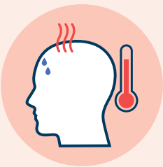
FEVER OR CHILLS