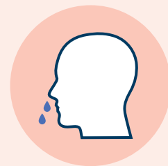
RUNNY OR BLOCKED NOSE