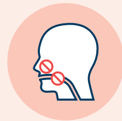
LOSS OF TASTE OR SMELL