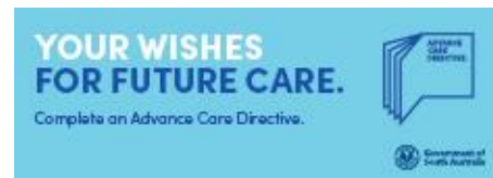
Website promo panel