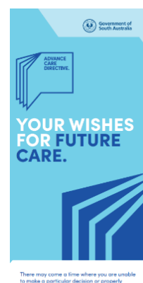
Brochures: standard brochure, brochure for Aboriginal community.