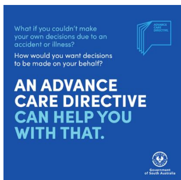
Social media assets