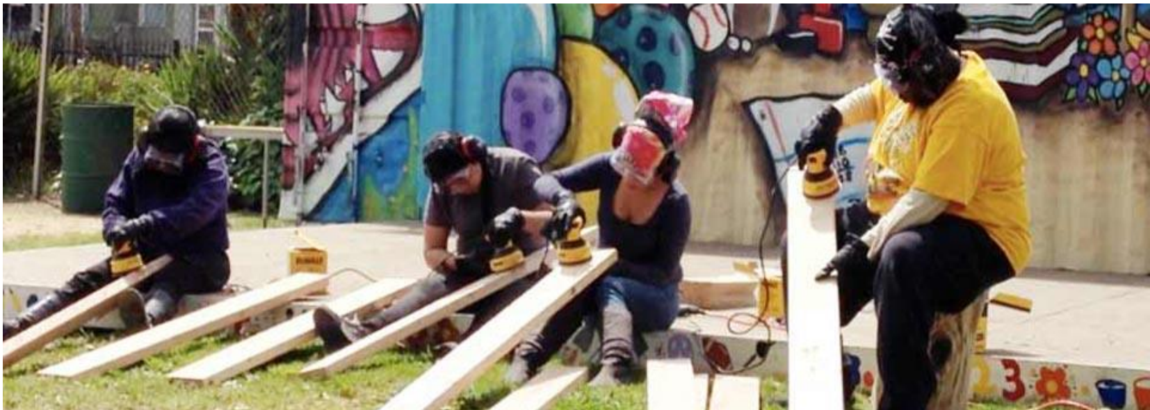
Pogo Park, Richmond, California

Draft goal: Increase access to tree canopy and parks in under-resourced and low-income communities.