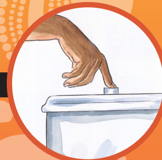
5. Flush toilet