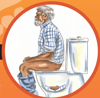
1. Do a poo