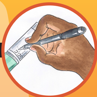
1. Write on tube label