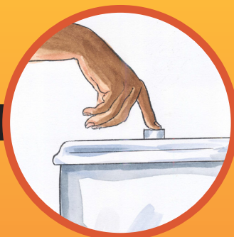
2. Do a wee and flush