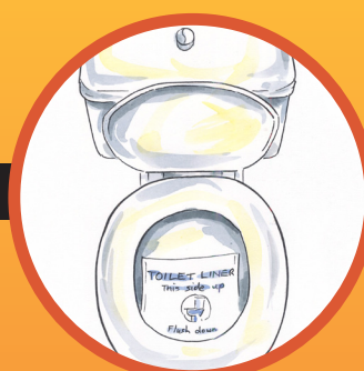
3. Put liner in toilet