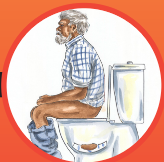
3. Next poo, repeat with second tube