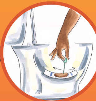
3. Scrape stick through poo