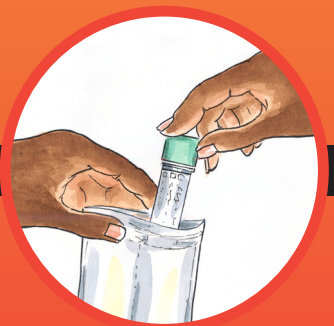
1. Place tube in bag 2. Put sample in fridge