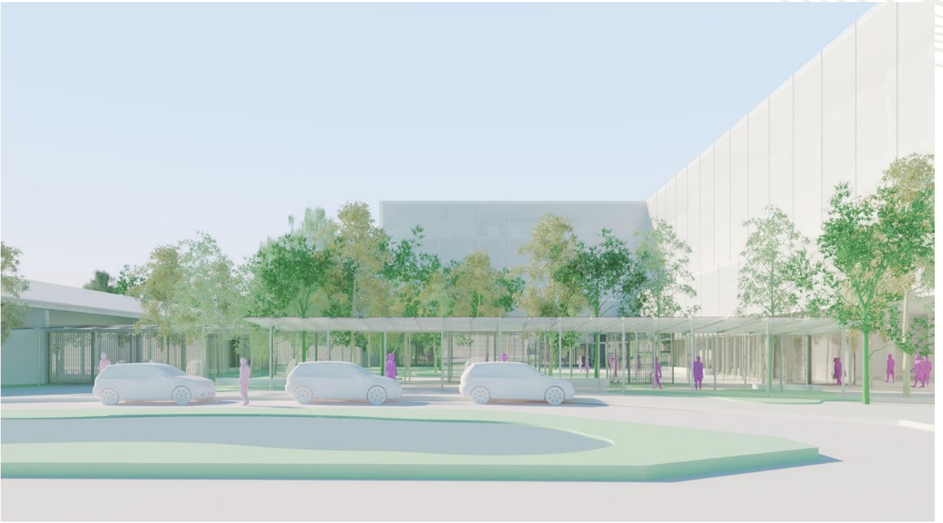
Image 3: Artist impression of the arrival experience at the NMBH, not to accurate scale and mature trees shown are for illustrative purposes only.